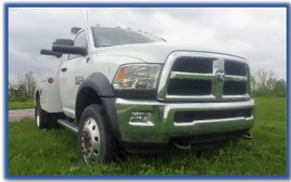
2015 Dodge Ram 5500 Tow Truck

Cummins 325 HP 6.7L 6 Cylinder Turbo Diesel Engine 4x4 Drive 560 Torque Dual Rear Wheel Automatic Hydraulic Brakes AM/FM Stereo CD Player with Aux Input Power Heated Mirrors 25,000 lbs. GVWR 7,000 lbs. Front Axle 13,500 lbs. Rear Axle Miller Industries Winch Miller Industries Wheel Lift LED Light Bar 93,318 Miles